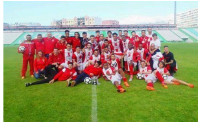
Portugal - Trophies won in national competition.